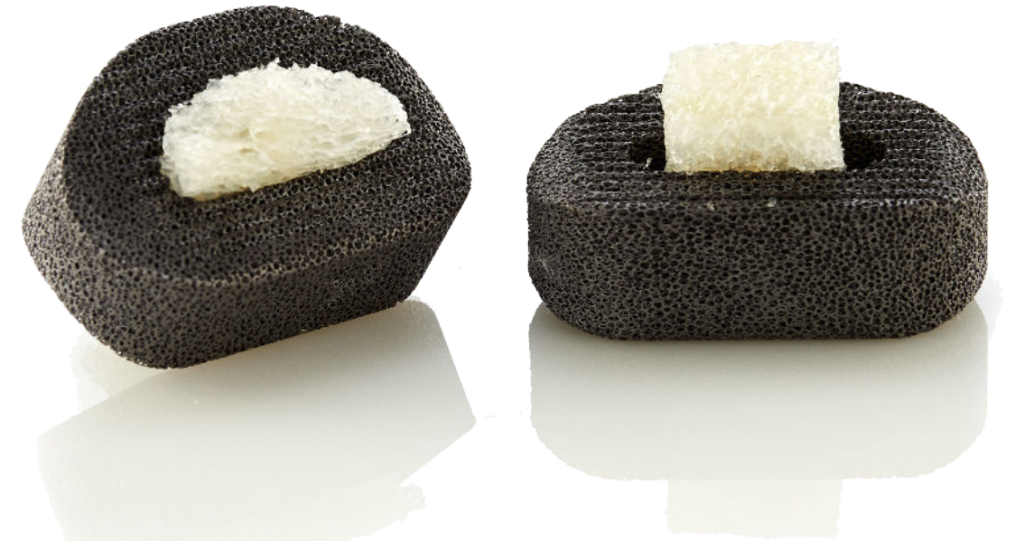
Fully demineralized Puros blocks and strips can be used with Trabecular Metal™ Material (TM-400 Device)

Puros DBM Block and Strip are available in a variety of configurations to minimize the need for shaping during the surgical procedure. They are conveniently provided sterile with up to a five-year shelf life at room temperature.