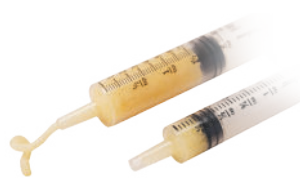
PUROS DBM WITH RPM PASTE