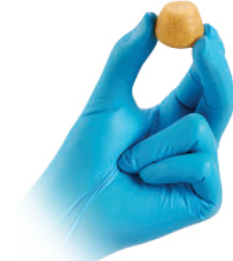
PUROS DBM WITH RPM PUTTY