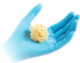
PUROS DBM WITH RPM GEL