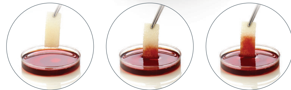
BLOOD-WICKING CAPABILITIES (AFTER MINIMAL PREPARATION)