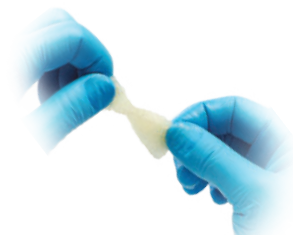
PUROS DBM STRIP