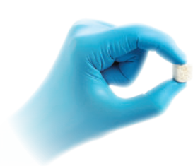
PUROS DBM BLOCK

With a variety of options, the Puros family of products can stimulate natural bone formation and assist in the healing process. Used alone or as a bone graft extender, Puros DBM allografts provide osteoconductive and osteoinductive properties, convenient handling and graft containment, and are provided ready to use.