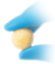
PUROS DBM WITH RPM PUTTY WITH CHIPS