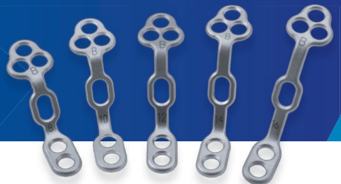
Plate with hook